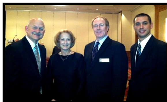
Executive of the Year Banquet, a black-tie event to wrap up the conference.