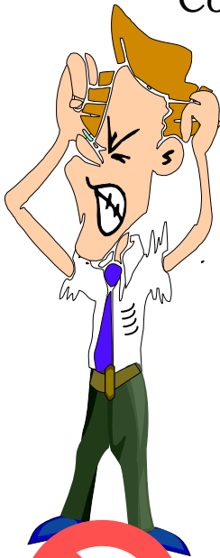
Skippy and Angry